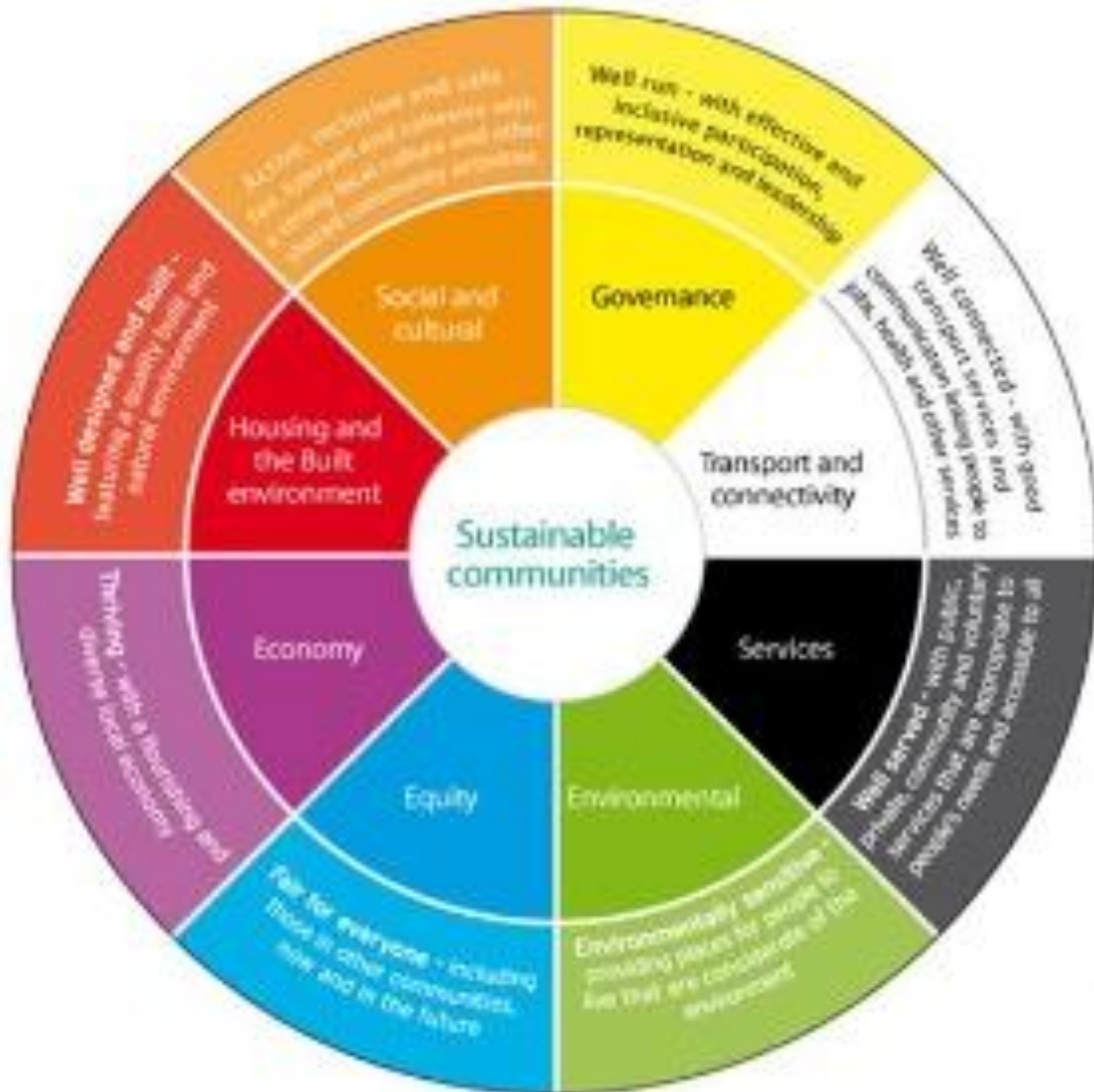
Figure 1: EGAN Wheel

When placed against the background that the strategic importance of urban areas as growth centres of the emerging global service economy in relation to sustainable development has increasingly been given credence to [2; 21; 22; 23; 24; 25] and that urban sustainability problems are not necessary characteristics of urbanization but could rather be considered as fallouts of poor governance and planning [26; 27; 28], urban design presents many possibilities to improve the situation [7]. Further research graphically shows that the world is urbanizing at an unprecedented rate, and that two-thirds of the world's 9.8 billion people will live in urban areas by 2050 [29]. The corresponding increase in global urban land cover during the first three decades of the 21st century is also touted to be greater than the cumulative urban expansion before the year 2000 [30].